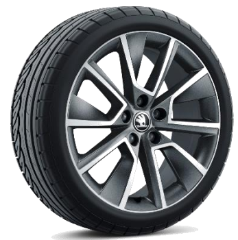
18" 'BRAGA' Anthracite Alloys - $1,500

* Fuel consumption values obtained using WLTP Standard - http://www.skoda.co.nz/owners/wltp