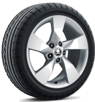
17" 'NIVALIS' Alloys STANDARD ON SCOUT