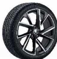
19" 'VEGA' Alloys

* Fuel consumption values obtained using NEDC Standard and are based on European models.