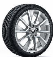
18" 'BRAGA' Alloys