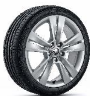
18" 'MYTIKAS' Alloys