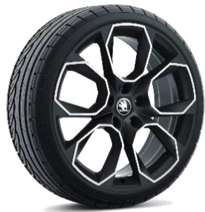
19" 'XTREME' Gloss Black Alloys STANDARD ON RS245

** Standard warranty. Other promotional offers may exceed standard terms, and if selected they would be added to vehicle price.