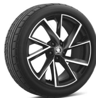
19" 'VEGA' Alloys STANDARD ON SPORTLINE'