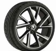
19" 'VEGA' Anthracite Alloys

* Fuel consumption values obtained are the highest result using WLTP Standard - http://www.skoda.co.nz/owners/wltp