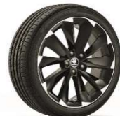
19" 'SUPERNOVA' Alloys