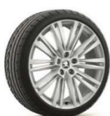
19" 'CANOPUS' Alloys