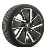
19" 'VEGA AERO' Alloys