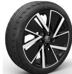
18" 'VEGA AERO' Alloys

* Fuel consumption values obtained using NEDC Standard and are based on European model.