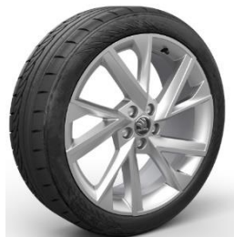
18" 'VEGA' Alloys