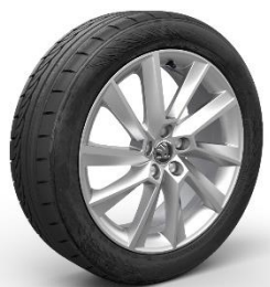
17" 'STRATOS' Alloys