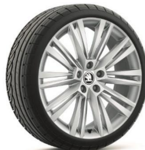
19" 'CANOPUS' Alloys