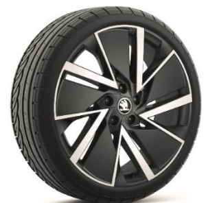
19" 'VEGA AERO' Alloys