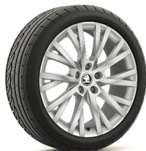
18" 'ANTARES' Alloys