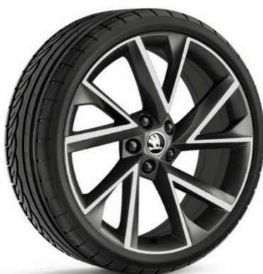
19" 'VEGA' Anthracite Alloys