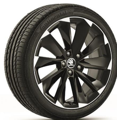
19" 'SUPERNOVA' Black Alloys