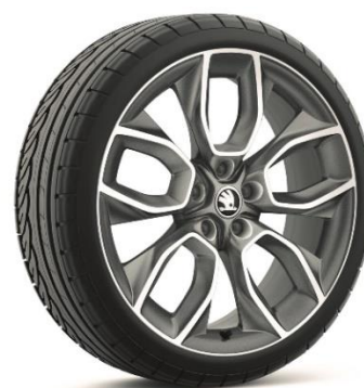
19" "MANSALU" anthracite polished alloy wheels