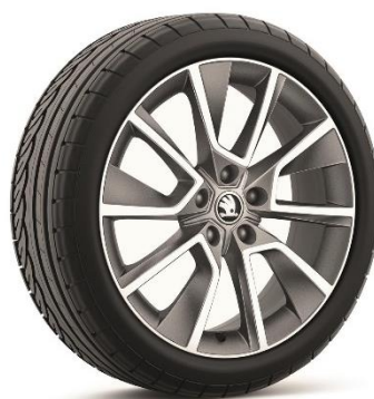
18" "BRAGA" anthracite polished alloy wheels