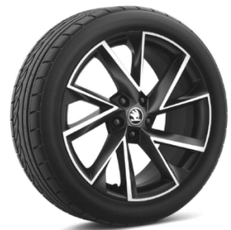
19" 'VEGA' Alloys STANDARD ON SPORTLINE'