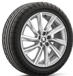
17" 'STRATOS' Alloys