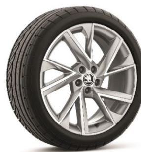
18" 'VEGA' Alloys