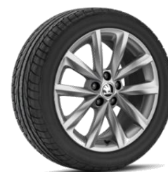
16" 'VIGO' Alloys - $750

*Prices are maximum retail including 15% GST. Prices & specifications are subject to change without notice. Maximum Retail Price does not include additional on road costs.