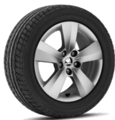
15" 'MATONE' Alloys - STANDARD